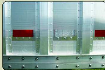
Extruded Aluminum Lower Rail Post on 12" Centers