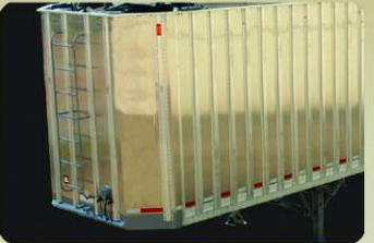
18" Diagonal Front Design