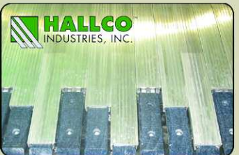
Hallco Live Floors