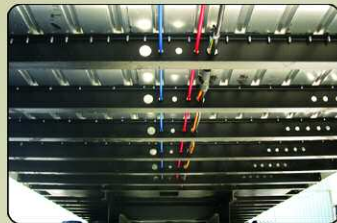
Waxed Coated Floor Sills on 12" Centers

In 1911, the folks in Elba, Alabama set out to build the most durable custom trailers on the market. Today, Dorsey's vision remains the same.