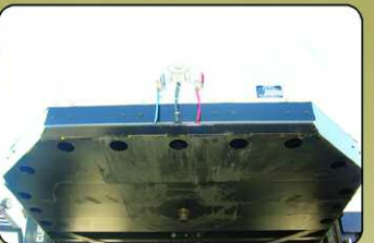
Full Width Upper Coupler with Integrated Pick-up