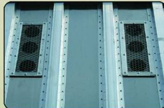
Aluminum Vent Covers