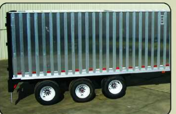
Multiple Axle Configurations