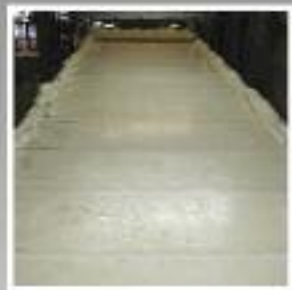
Foam in Place Roof to Side Adhesion