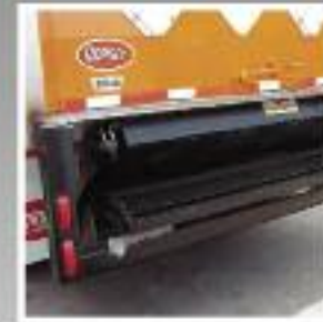
Optional Tuck Away Liftgate