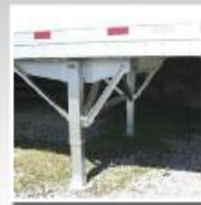
Standard Two-Speed Landing Gear 50,000 lb capacity