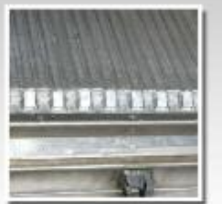
Optional Customized Floor System