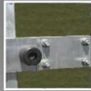
Standard 4-Bolt Hinges - (4) Four per Door with Integrated Bumper