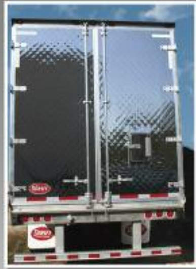
Standard Stainless Rear Frame, Galvanized Door Locks, Stainless Quilted Rear Doors, LED Light Package Rear Header and Bumper