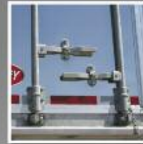
Optional Quad Hardware Door Locks