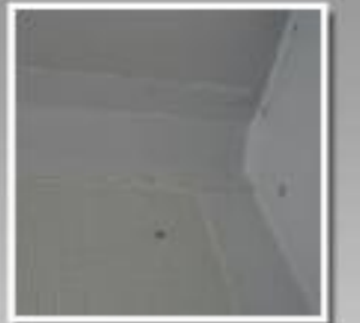
Standard Aluminum Cove Molding used in Corner Closures for Greater Insulation