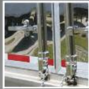
Optional Stainless Steel Door Locks