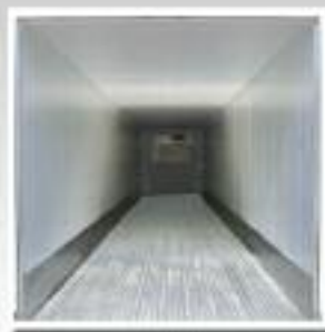
Smooth Insulated Side Walls and Ceiling lined with Fiberglass