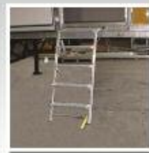
Optional Pull-out Platform and Step