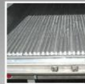
Standard Heavy Duty Duct Type Floor