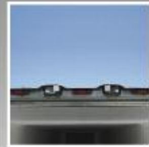
Optional Shallow Rear Door Header