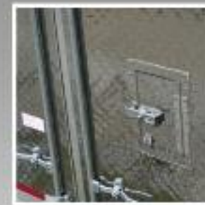
Optional Stainless Steel Door Vent