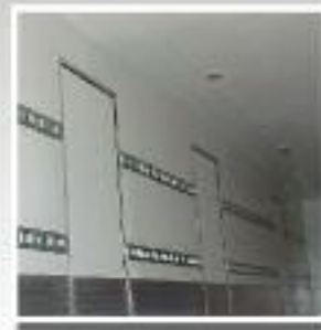
Optional Dome Lights and Surface Mounted E-Track