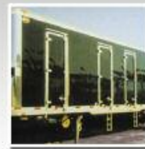
Optional Side Doors