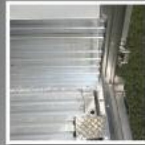
Standard 11" Heavy Duty Scuff Welded at Rear