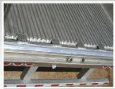
Optional Dock Board Guide Plates