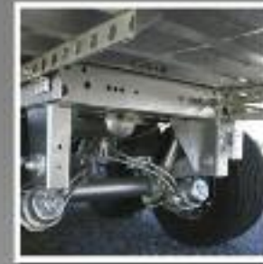
Standard Suspension, Air Ride Slider W/Aluminum Optional Color Corrosion Resistant Paint