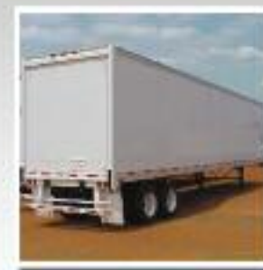
Optional Roll-Up Door Pictured with painted rear frame