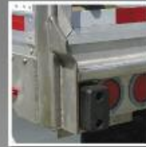
Standard Rubber Bumper Blocks and Rear Gusset