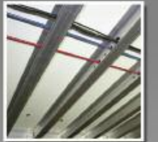
Optional 4" Aluminum Crossmembers with Integrated Electrical and Airlines for max protection